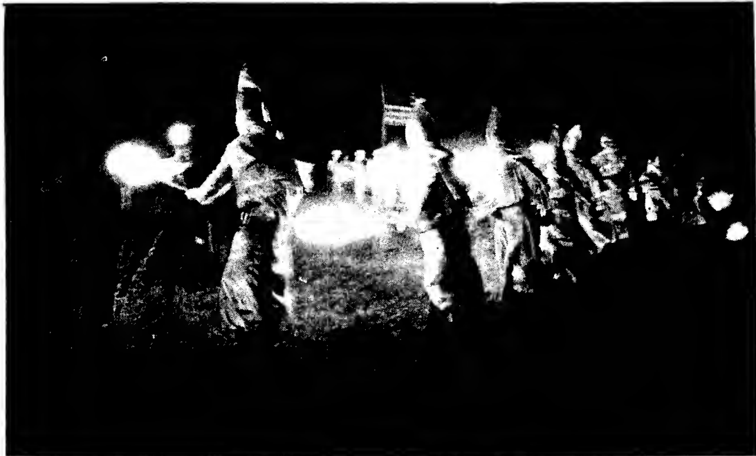
The torch lighting ceremony